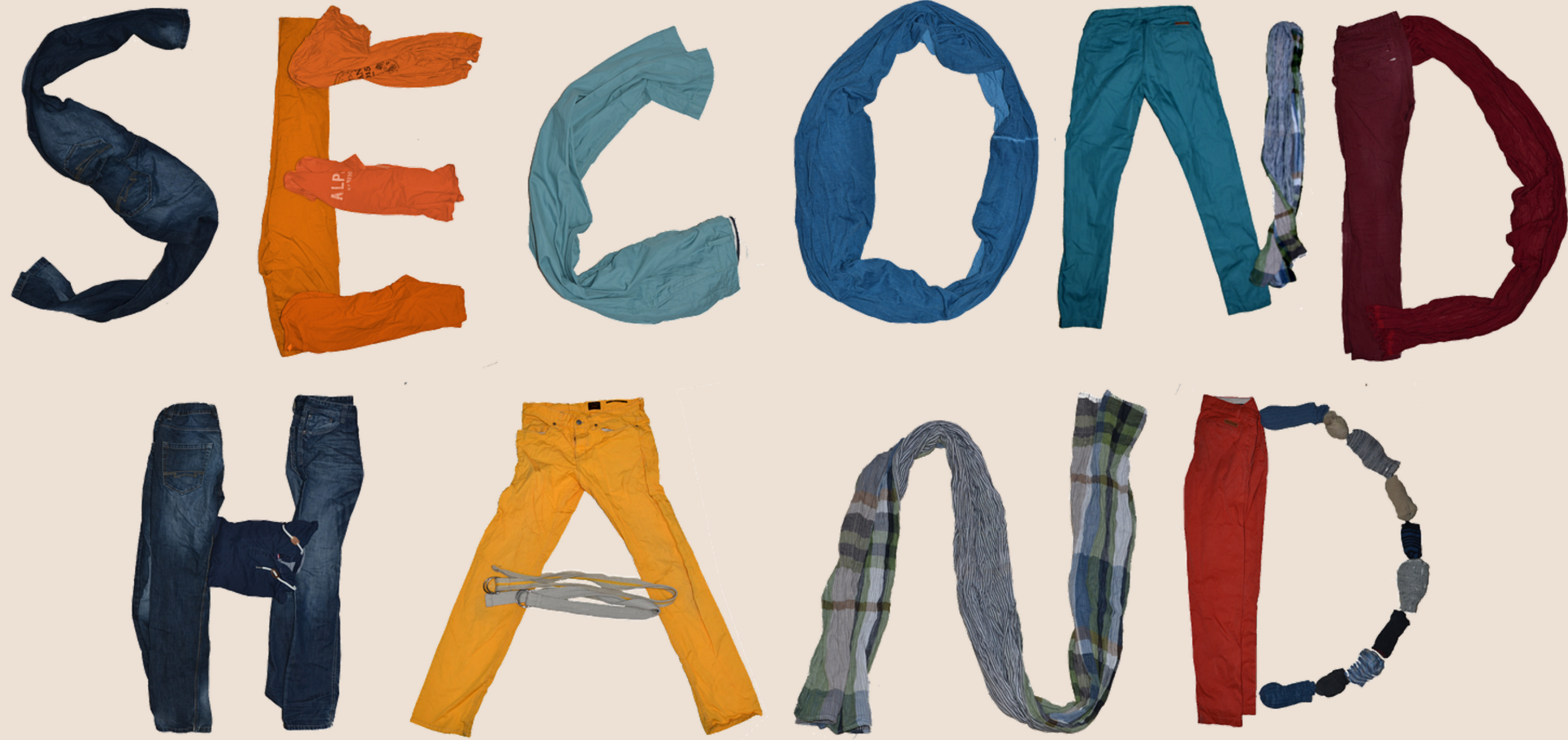
A Thrift Mela